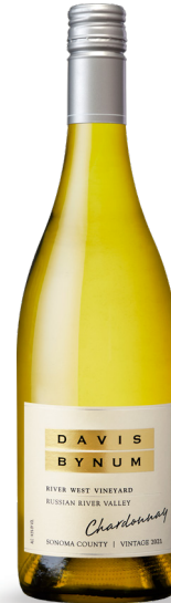
2021 Davis Bynum River West Vineyard Chardonnay Russian River Valley