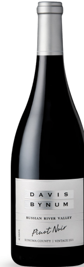
2021 Davis Bynum Pinot Noir Russian River Valley