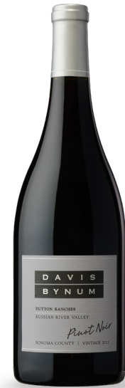
2021 Davis Bynum Dutton Ranches Pinot Noir Russian River Valley