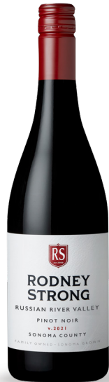
2021 Rodney Strong Pinot Noir Russian River Valley