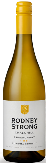
2021 Rodney Strong Chalk Hill Chardonnay Sonoma County